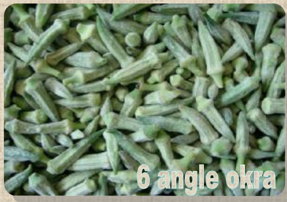
6 angle okra