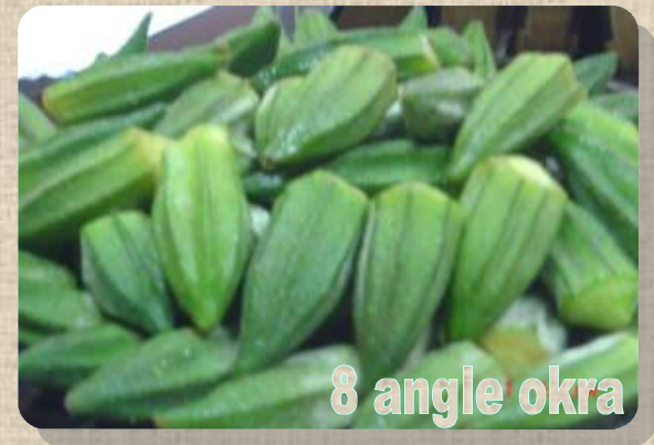
8 angle okra