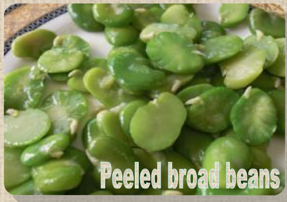
Peeled broad beans